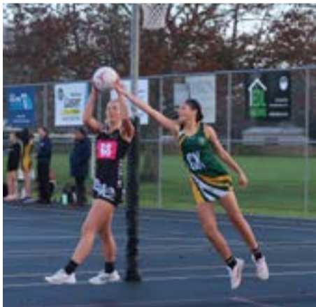
Hauraki Plains College and Paeroa College battle it out on the court during the Boulton Cup.

The next goal the team will work towards is the Upper North Island Secondary Schools Netball Championships (UNISS) in September this year.