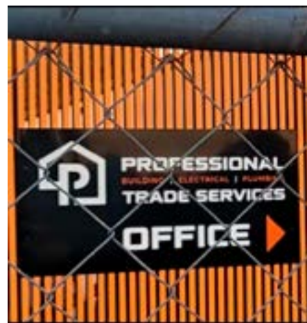
The Professional Trade Services sign at its former premises at 3 Coronation St, Paeroa.