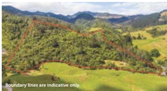
Boundary lines are indicative only.