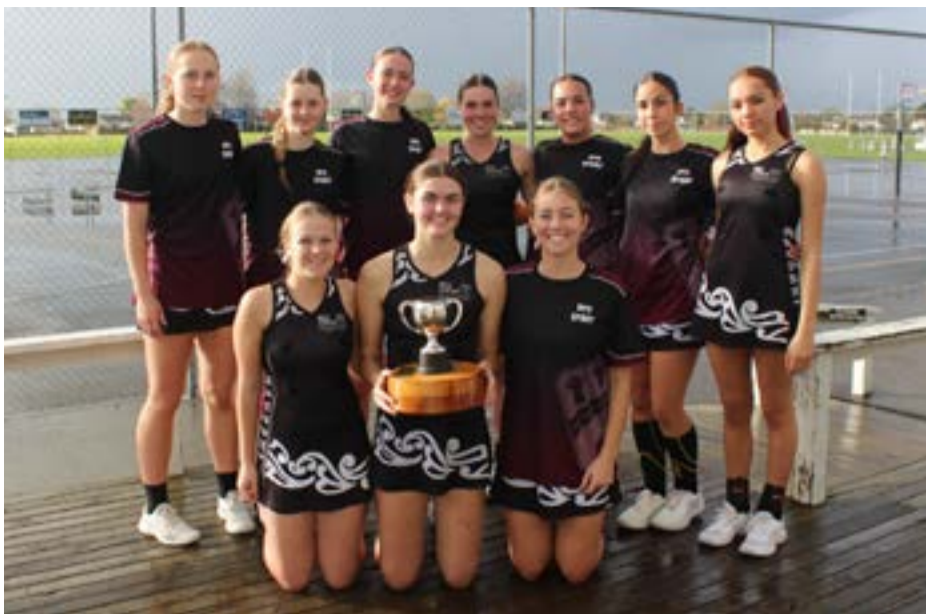
The Hauraki Plains College A Netball team wins the Boulton Cup for 2026.

Email your sports news, reports and photos to editor@valleyprofile.co.nz