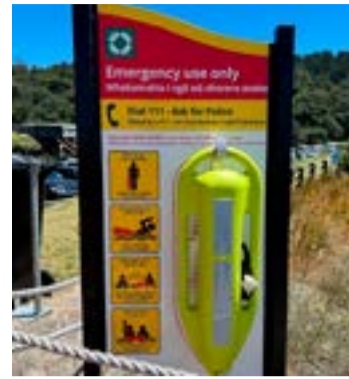
Beach safety signs and rescue buoys have been rolled out to beaches around Waihi Beach.

The club urged people to keep an eye out for the beach safety signs. Only a few months ago, an off-duty lifeguard used the PRE buoy at Anzac Bay to rescue a person in serious trouble.