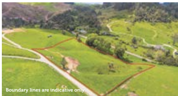
Boundary lines are indicative only.