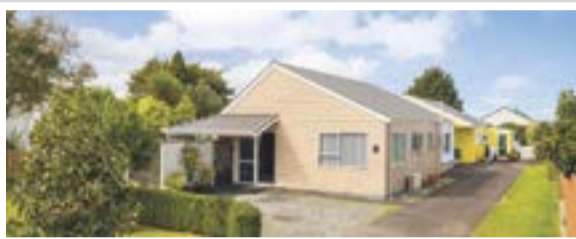
Waihi 75A Consols Street