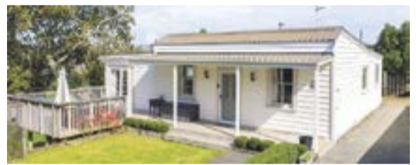
Waihi 10 Clarke Street