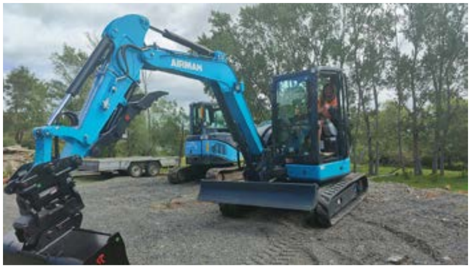
Meares Earthworks offer their services in Waihi, Waihi Beach, Paeroa, Katikati, and areas in the Waikato, Bay of Plenty, Hauraki and Coromandel.