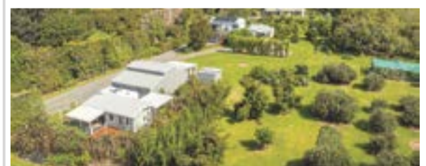
Katikati 10A Bridgman Lane, Tanners Point