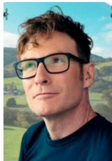
Comedian Te Radar.