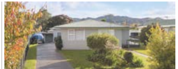
Waihi 122 Parry Palm Avenue