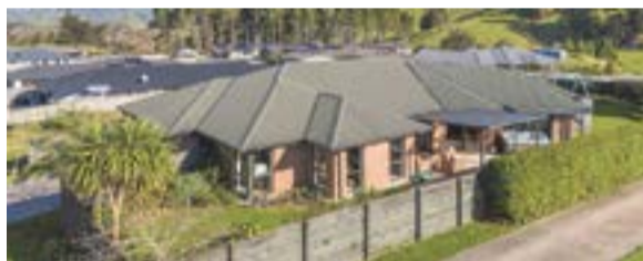
Waihi 25 Thorn Road