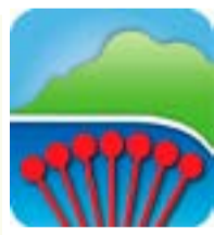
The Coromandel App

FIND US ONLINE: Visit www.valleyprofile.co.nz or download the Coromandel App on your smartphone. ISSN: 2703-5700