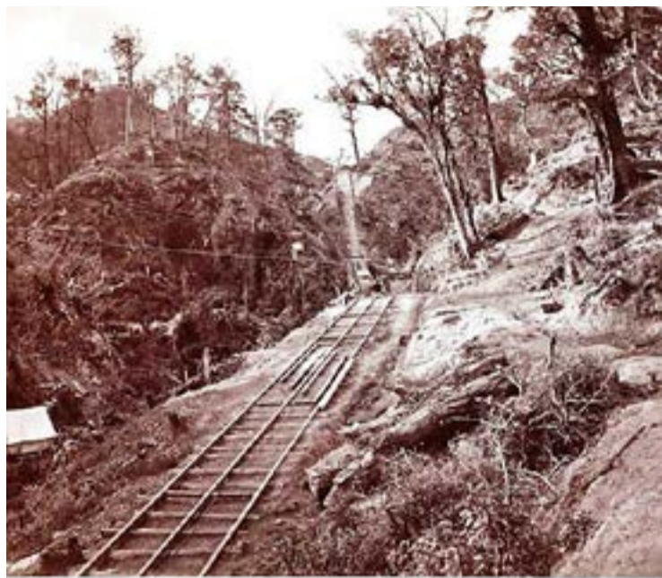
A pig seized a horse by the nose on the Moanataiari tramway.

Meanwhile, the installation of gas pipes and five iron lamp posts along Thames' Goods Wharf was celebrated when the gas was lit for the first time, grandly illuminating the wharf. The Thames Scottish Volunteer band, playing various airs,