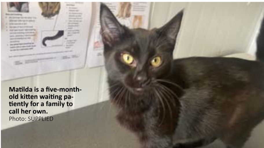
Matilda is a five-month-old kitten waiting patiently for a family to call her own.