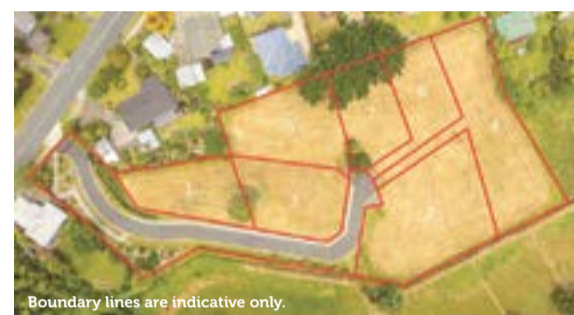
Boundary lines are indicative only.