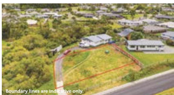
Boundary lines are indicative only.

Our team of expert salespeople are committed to helping your 2026 property goals come true. Check out this fantastic range of properties currently for sale.