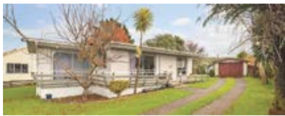
Waihi 38 Princes Street