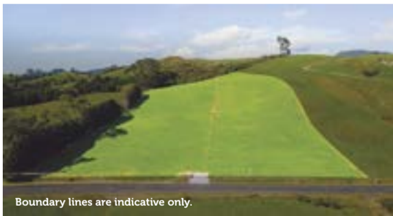
Boundary lines are indicative only.