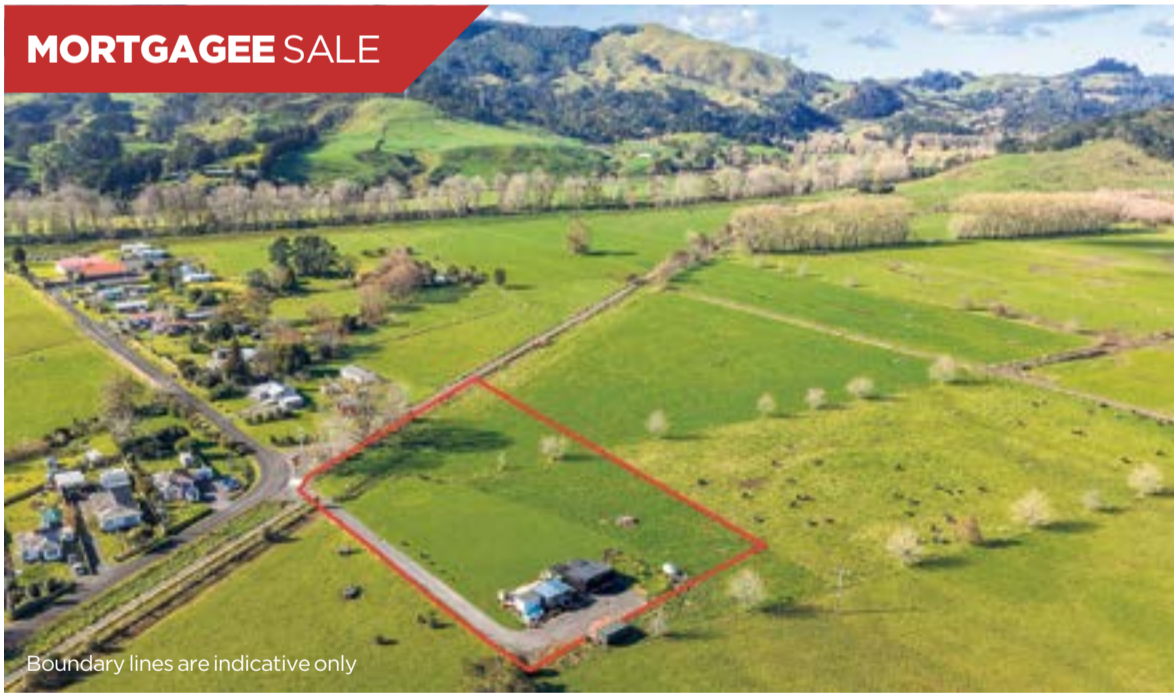
Boundary lines are indicative only

SUCCESS REALTY LIMITED, BAYLEYS, LICENSED UNDER THE REA ACT 2008