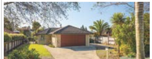
Waihi 11 Margaret Street