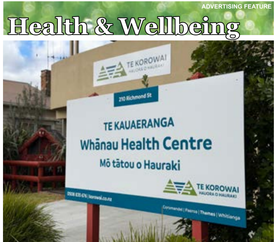
Te Korowai Hauora o Hauraki has re-located its Whānau Health Centre services back to their main site at 210 Richmond St.