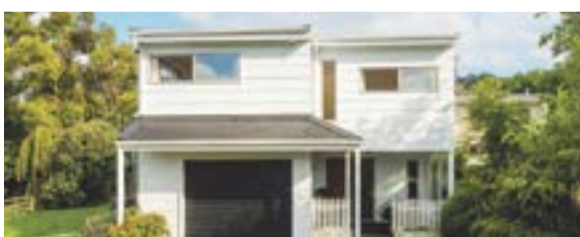
Waihi 35 Walmsley Road