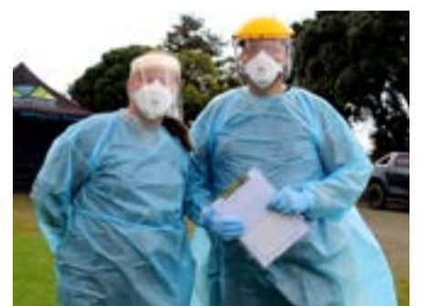
Te Korowai Hauora o Hauraki answered the call from Waikato DHB during Covid-19.

This collaboration with other health services - to bring a co-ordinated response to the unique challenges that the global pandemic posed in our area - was a fantastic example of our core value of whanaungatanga: what rural communities can do when we work together to deliver services, not only to our enrolled whānau, but to our visitors too.