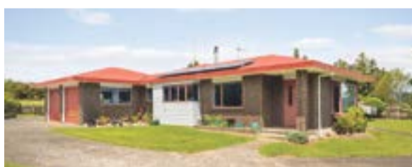
Waihi 7 Heath Road