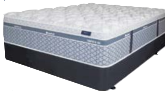
Chiropractic HDX Reflex Queen Bed

With the addition of KūlKōte to help maintain a comfortable temperature.