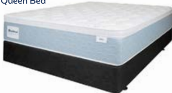
Serenity Eden Queen Bed

Featuring temperature control for a premium sleep experience.