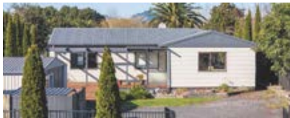
Waihi 43 Bradford Street