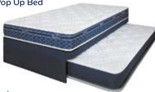
Chiropractic Perform Pop Up Bed

A drier, healthier sleep surface so you wake up feeling refreshed and restored.