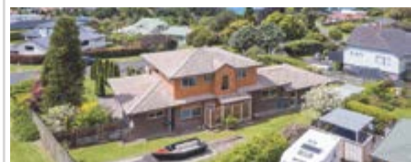
Katikati 2 Baigent Place, Tanners Point