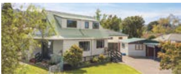
Waihi 33 Walker Street