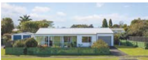
Waihi 9 Cornwall Street