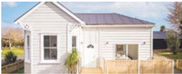
Waihi 24 Gilmour Street