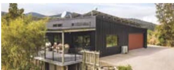
Waikino 542 Waitekauri Road