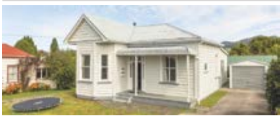
Waihi 31 Adams Street