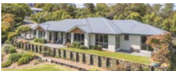
Waihi 83A Bulltown Road