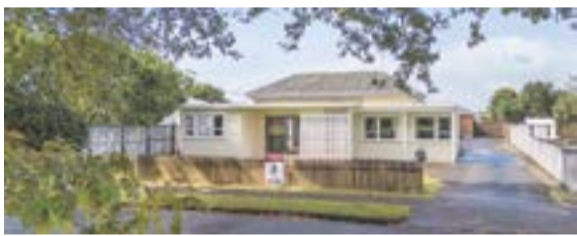
Waihi 93 Parry Palm Avenue