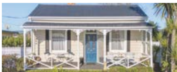
Waihi 8 Albert Street