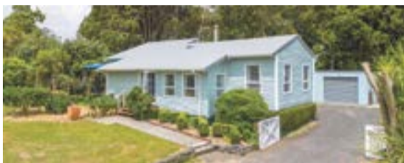
Waihi 135 Consols Street