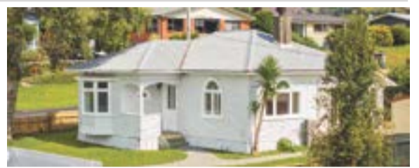
Waihi 6 Parry Palm Avenue