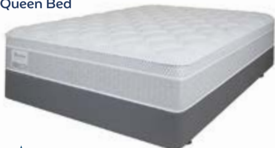
Serenity Breeze Queen Bed

Layers of Dreamfoam provide extra support and luxurious comfort.