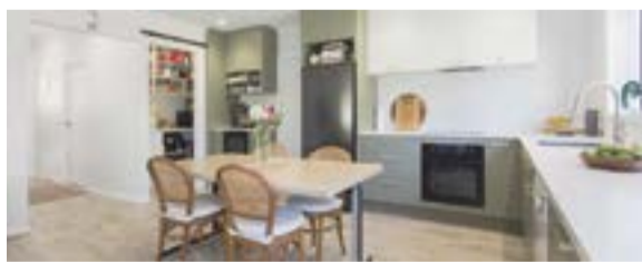
Waihi 33 Bradford Street