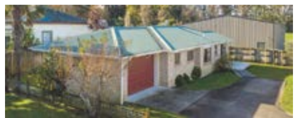
Waihi 82A Gladstone Road