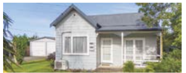
Waihi 10 Regent Street