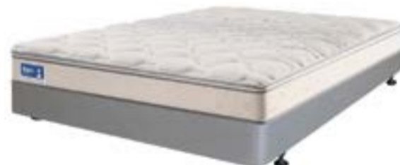
Chiropractic Epic Sleep Queen Bed

Featuring Torquezone, a coil spring system for targeted postural support.